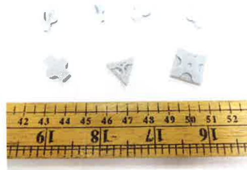
LaQ GRAY No.1-7