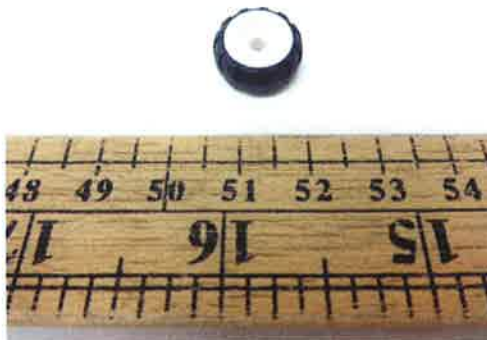
LaQ HAMACRON CONSTRUCTOR MINI WHEEL