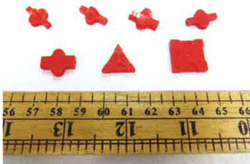
- LaQ RED No.1-7