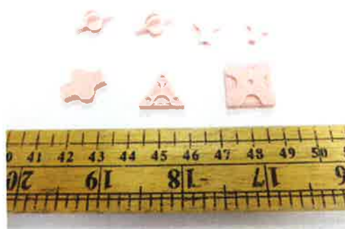
LaQ PINK No.1-7