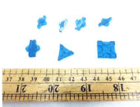
LaQ CLEAR BLUE No.1-7