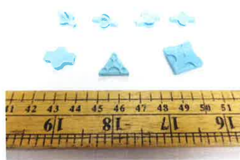
LaQ SKY BLUE No.1-7