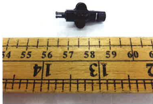
LaQ HAMACRON CONSTRUCTOR SHAFT