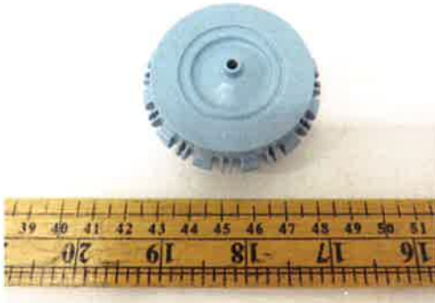
LaQ HAMACRON CONSTRUCTOR WHEEL