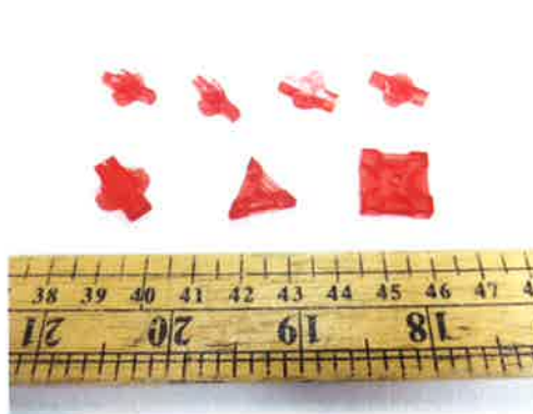
LaQ CLEAR RED No.1-7