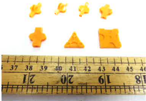
LaQ ORANGE No.1-7