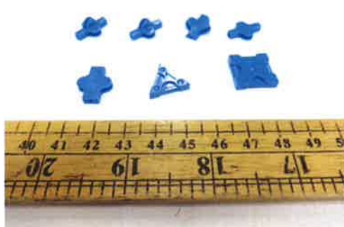
LaQ BLUE No.1-7