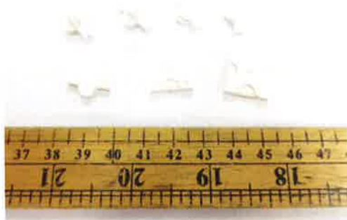
LaQ WHITE No.1-7