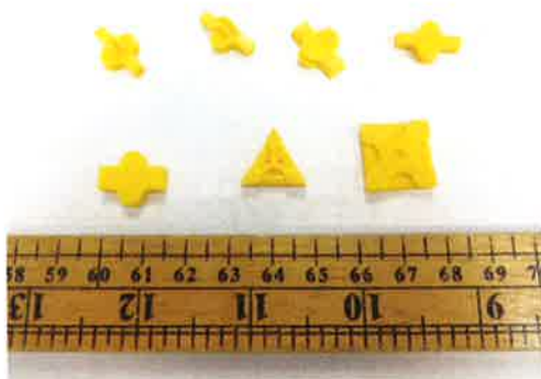
LaQ YELLOW No.1-7