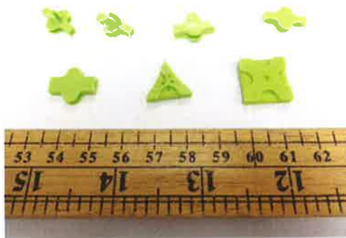
LaQ LIME No.1-7