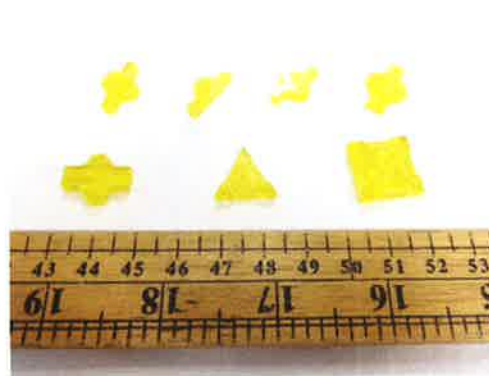
LaQ CLEAR YELLOW No.1-7