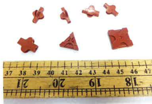
LaQ BROWN No.1-7