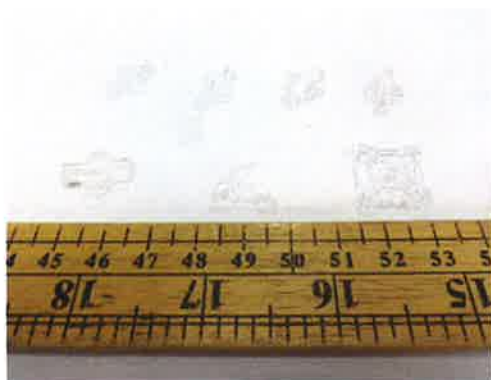
LaQ CLEAR No.1-7