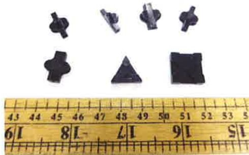
LaQ BLACK No.1-7