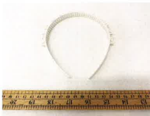
LaQ SWEET COLLECTION HEADBAND