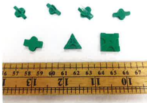
LaQ GREEN No.1-7